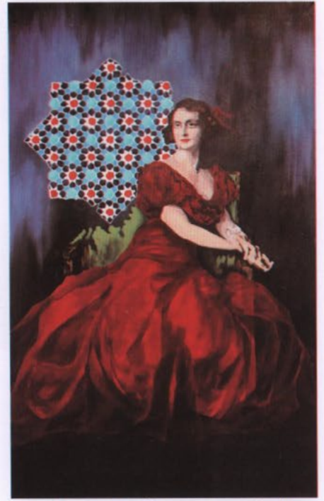
Zehra Fatima Tooba, Merging Tradition (Lady in Red), 2021, Acrylic on Canvas 60h x 36w inches