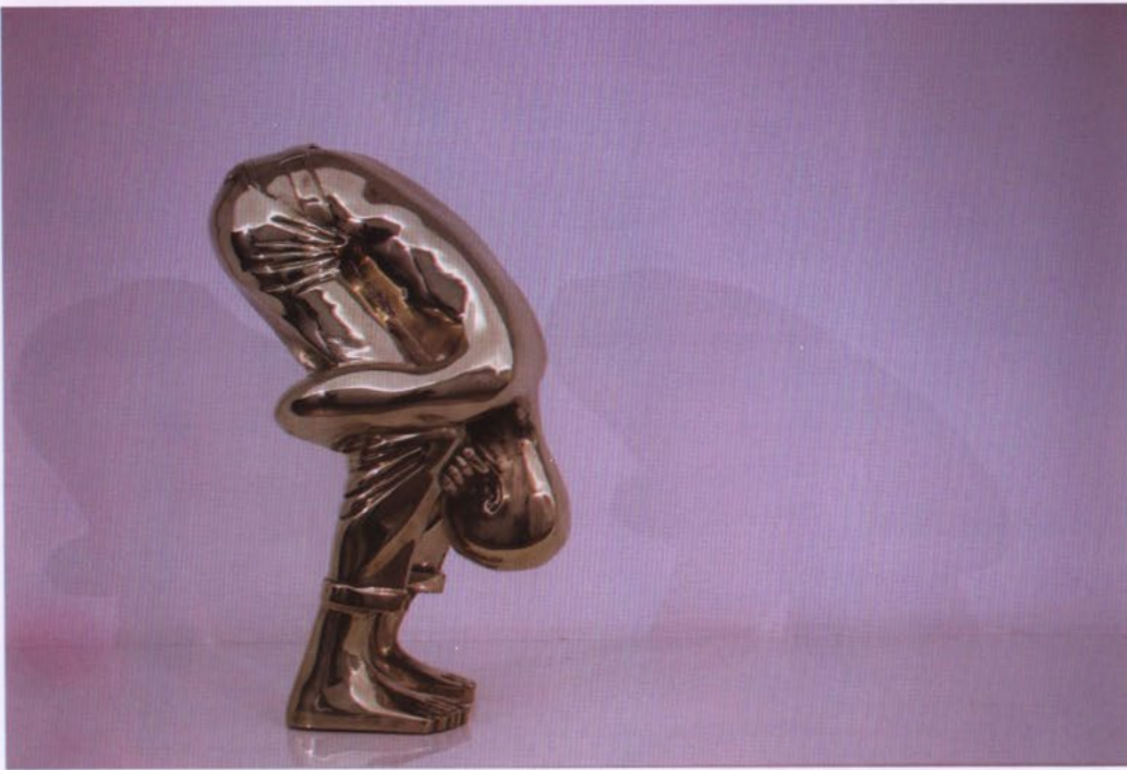
Fahim Rao, The Shadow of Murgha Punishment (Corporal Punishment Series), 2021 Brass, 9.80h x 14.90w x 17.70d inches, 1 of 4 + 2 A/P