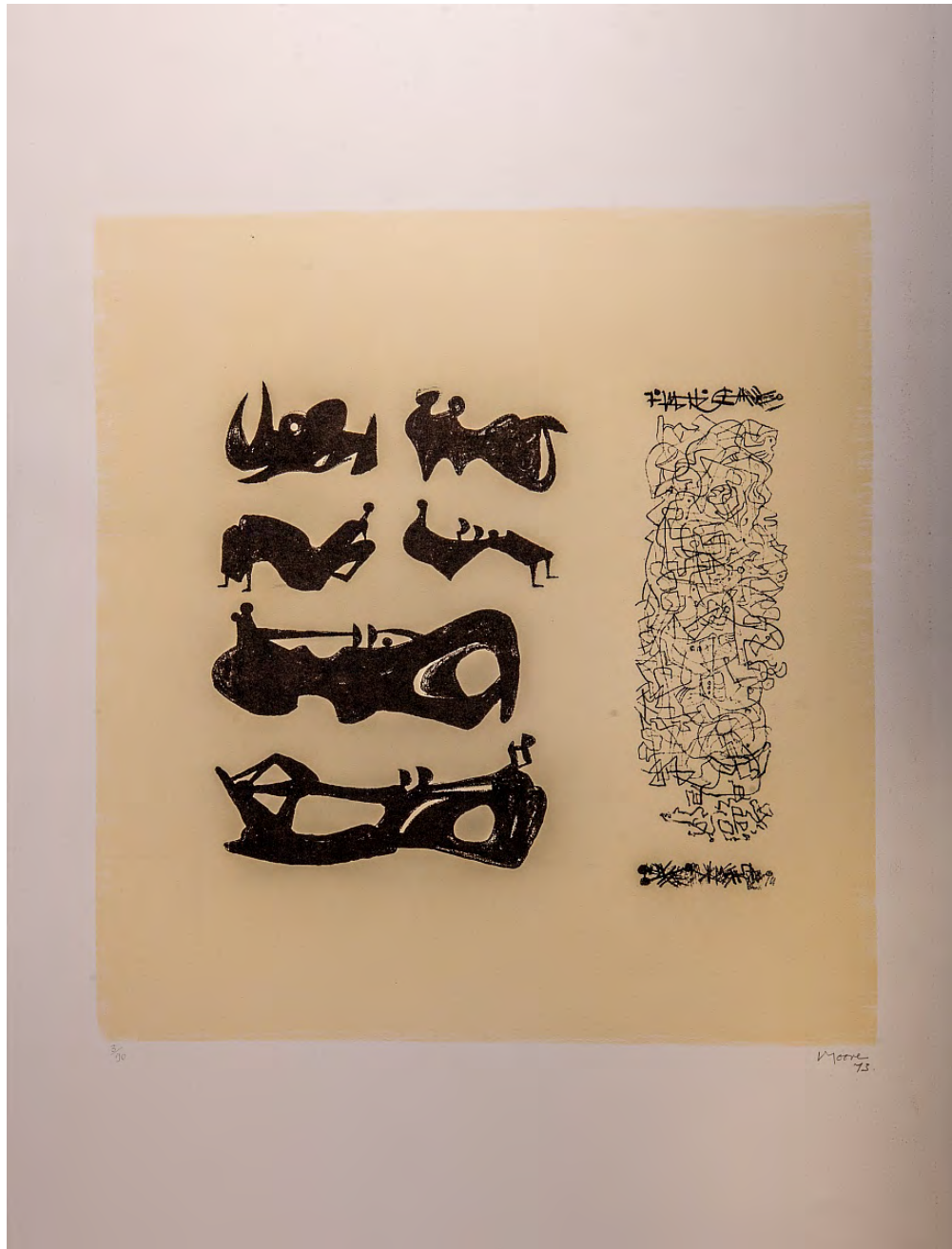
Henry Moore Silhouette Figures with Border Designs , 1973 Lithograph on Wove Paper 30.50h x 22w in Edition no. 3/90 NFS