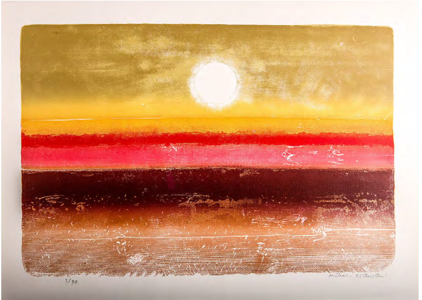
Michael Rothenstein Sunrise at 36,000 feet , 1973 Screen Print on Wove Paper 22h x 30.50w in Edition no. 3/90 NFS