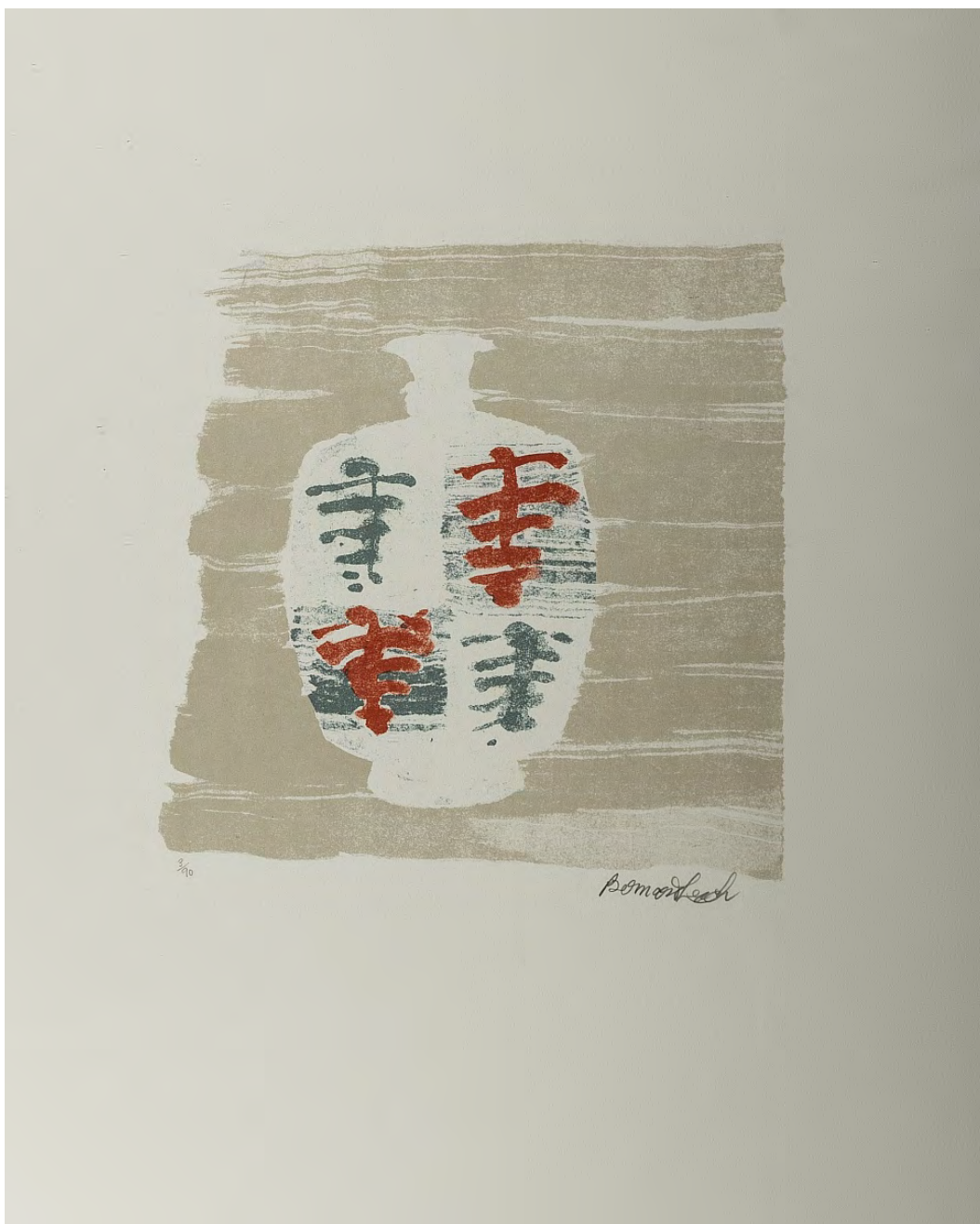
Bernard Leach Drawing for a pot , 1973 Lithograph on Wove Paper 30.50h x 22w in Edition no. 3/90 NFS