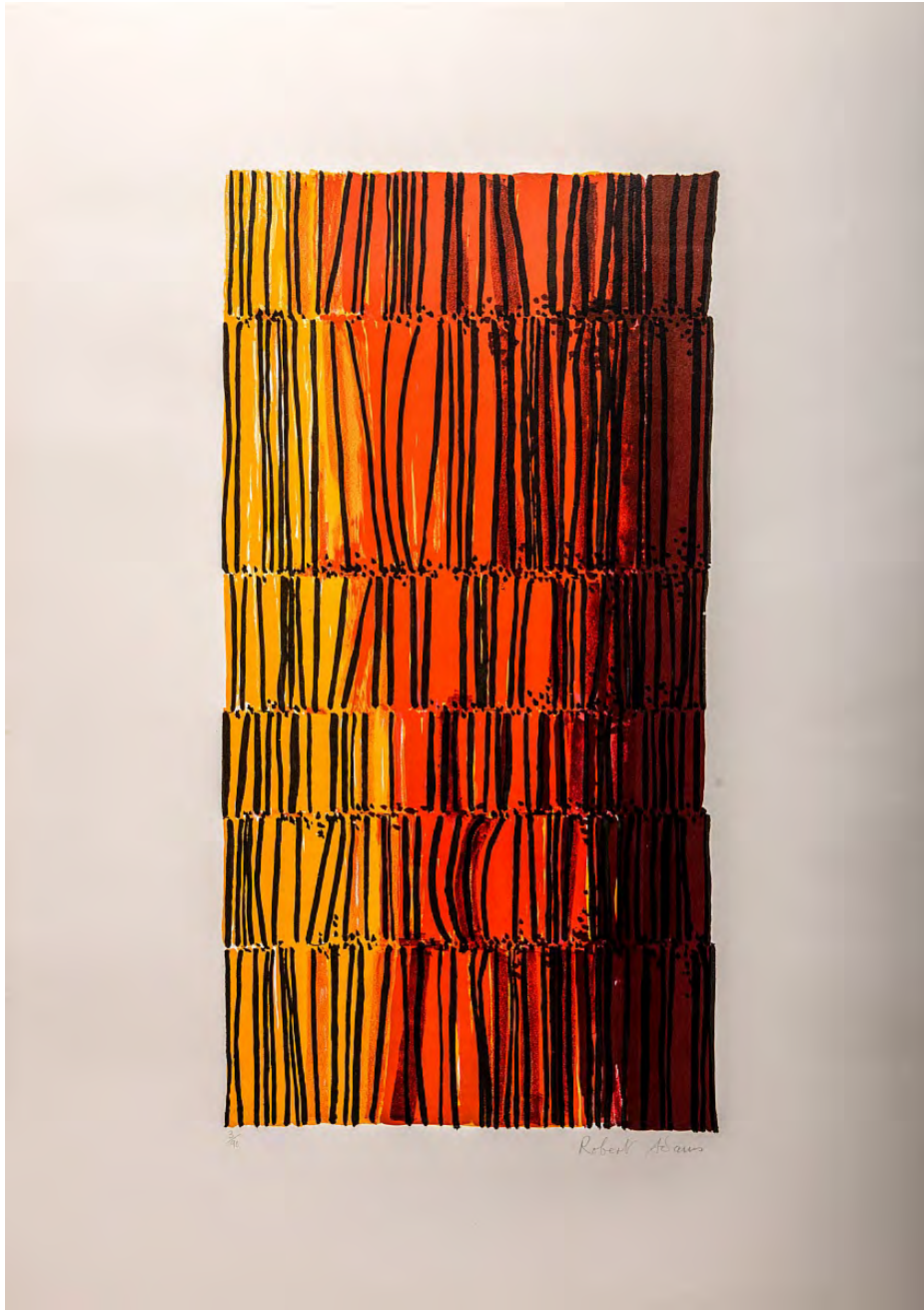
Robert Adams Screen Form, Unknown Lithograph on Wove Paper 30.50h x 22w in Edition no. 3/90 NFS