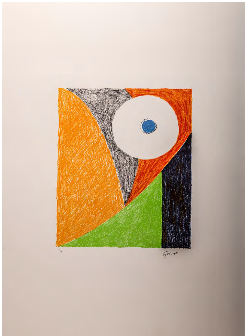
Duncan Grant Interior , 1973 Lithograph on Wove Paper 30.50h x 22w in Edition no. 3/90 NFS