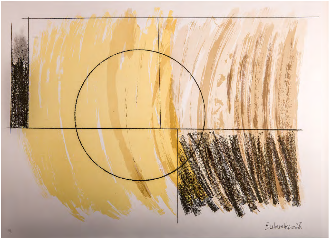
Barbara Hepworth Moon Landscape , 1973 Lithograph on Wove Paper 22h x 30.50w in Edition no. 3 of 90 NFS