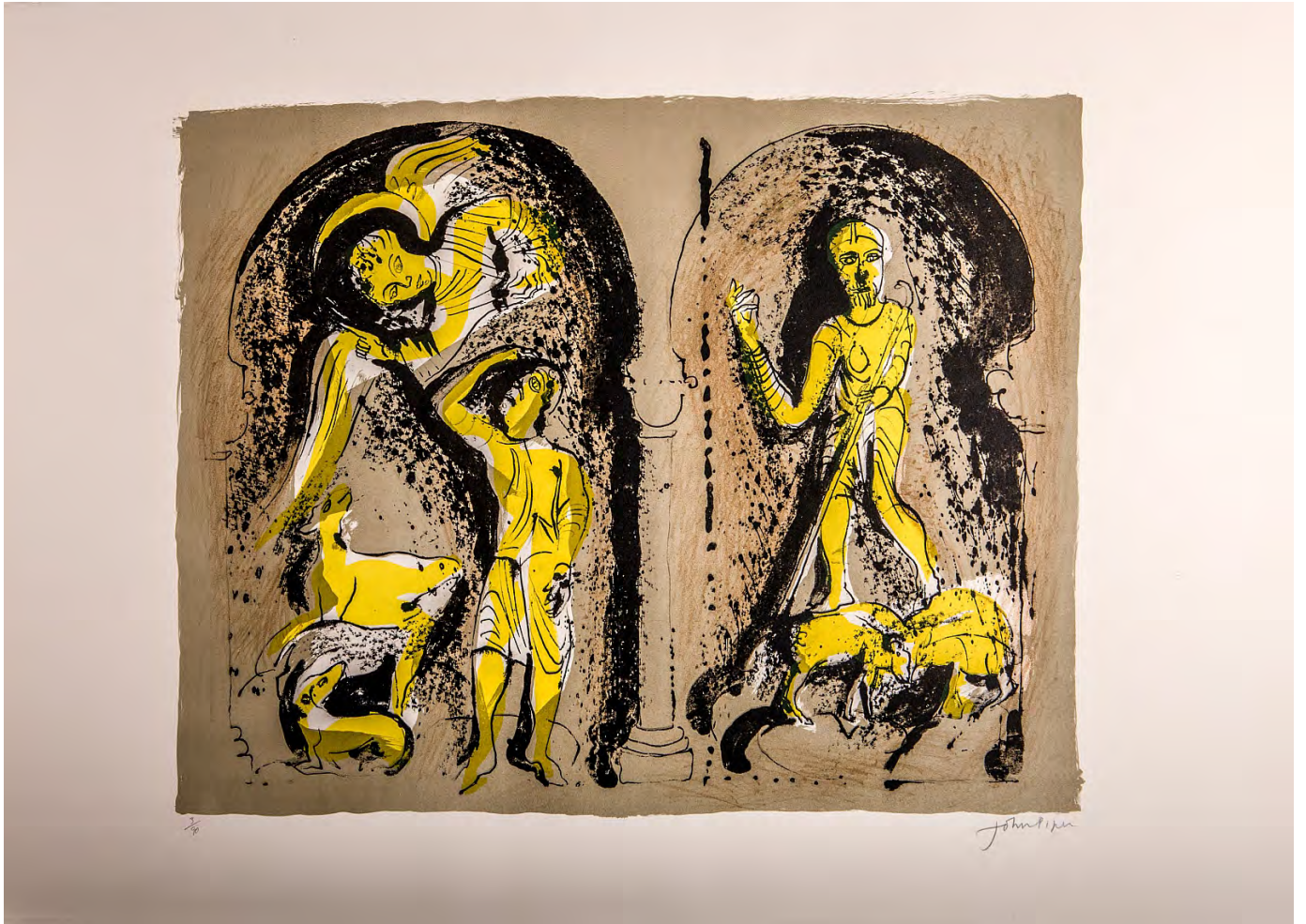
John Piper Annunciation to the Shepherds , 1973 Lithograph on Wove Paper 22h x 30.50w in Edition no. 3/90 NFS