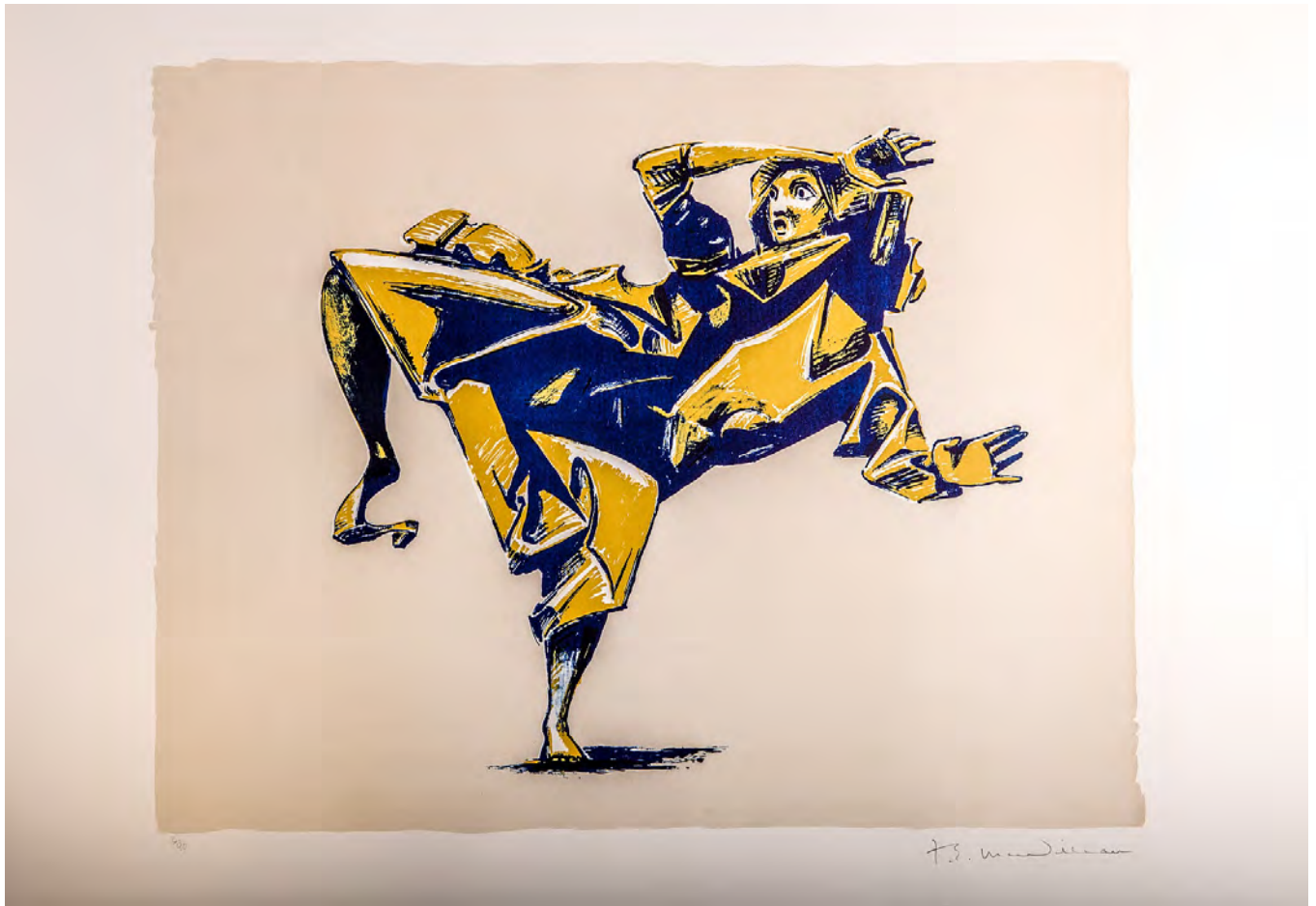
F.E. McWilliam Woman of Belfast , 1973 Lithograph on Wove Paper 22h x 30.50w in Edition no. 3/90 NFS