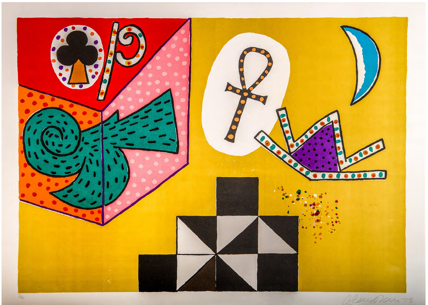
Alan Davie Bird through Wall , 1973 Lithograph on Wove Paper 22h x 30.50w in Edition no. 3/90 NFS