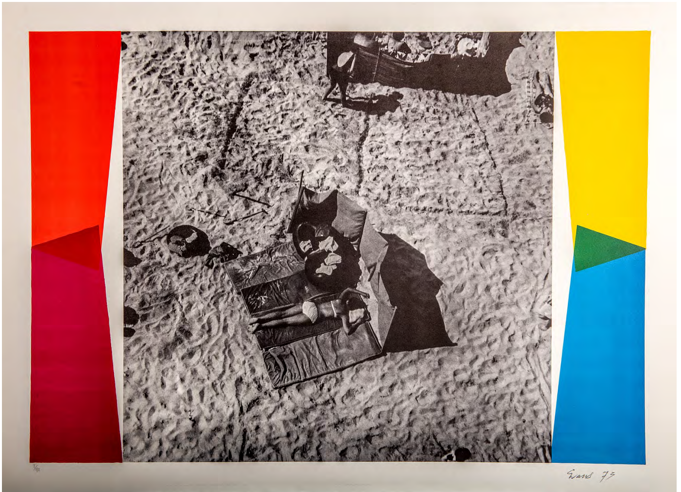
Merlyn Evans St. Ives Beach , 1973 Lithograph on Wove Paper 22h x 30.20w in Edition no. 3/90 NFS