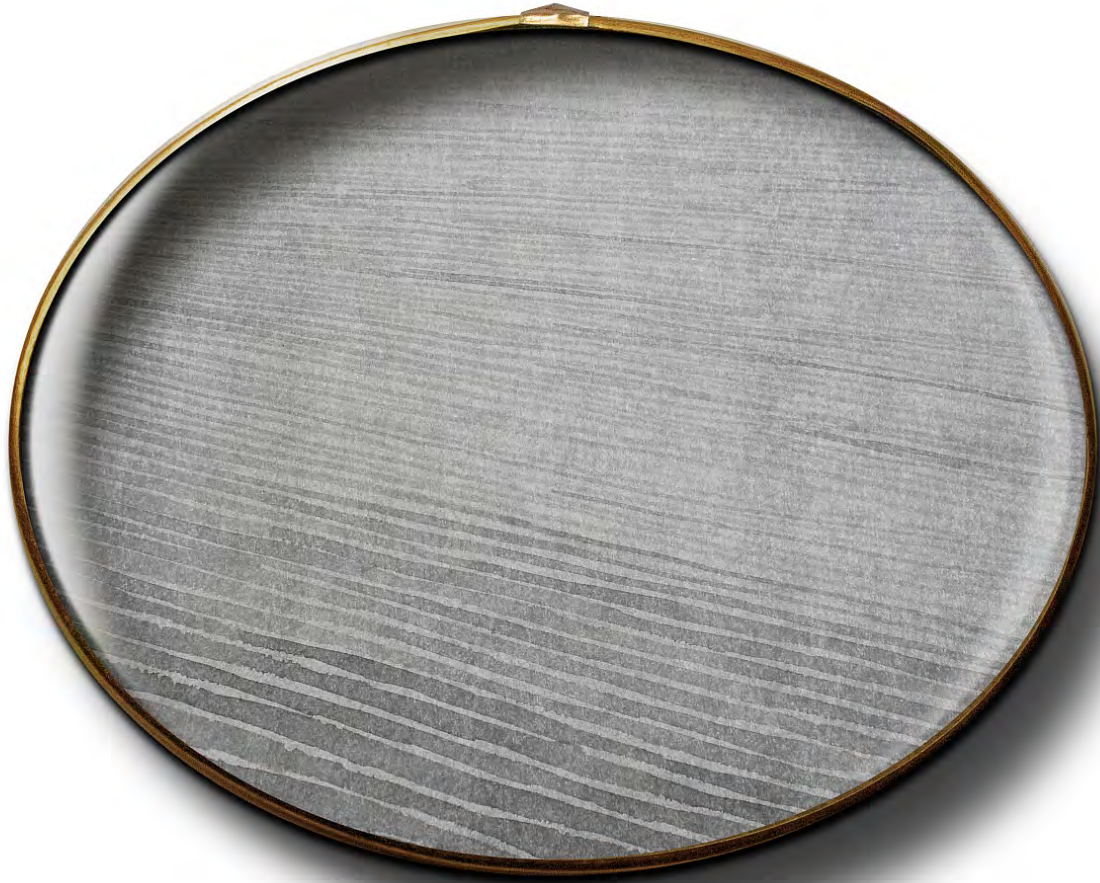
Fernando Martín Godoy Plowed Field , 2023 Ink on Paper and Antique Frame Framed Dimensions: 6.69h x 7.48w in PKR: 328,867.54