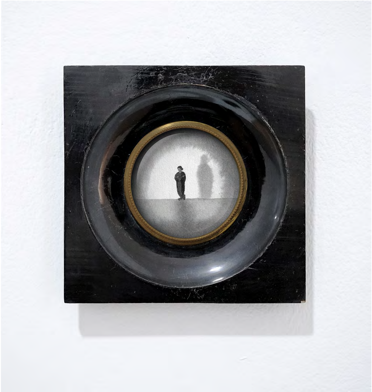
Fernando Martín Godoy Guardian I , 2024 Ink on Paper and Antique Frame Framed Dimensions: 5.31h x 5.31w in PKR: 292,728.25