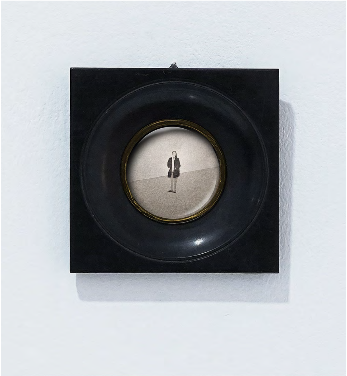
Fernando Martín Godoy Guardian IX , 2024 Ink on Paper and Antique Frame Framed Dimensions: 5.51h x 5.51w in PKR: 299,956.11