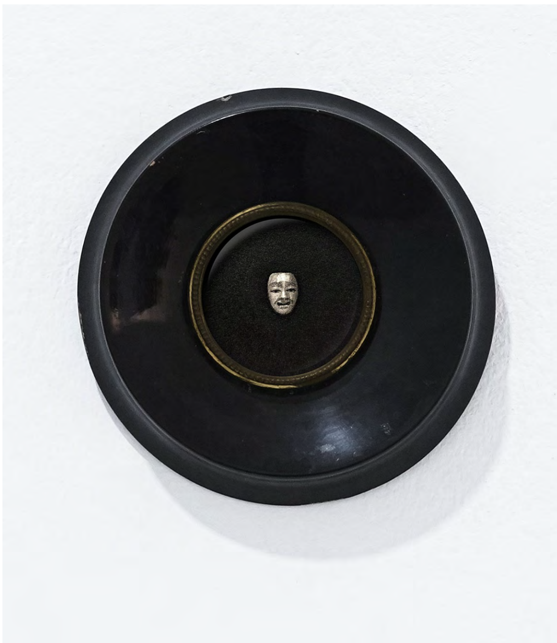
Fernando Martín Godoy Mask I (Noh) , 2024 Ink on Paper and Antique Frame Framed Dimensions: 4.72h x 4.72w in PKR: 274,658.60