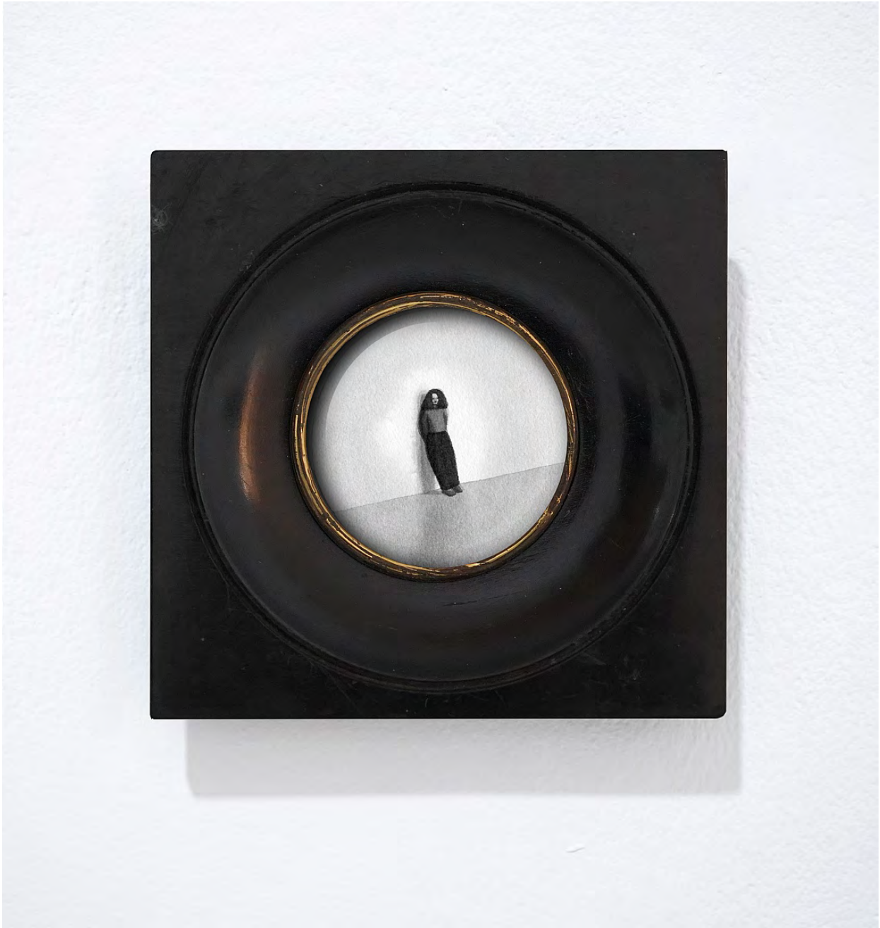
Fernando Martín Godoy Guardian II , 2024 Ink on Paper and Antique Frame Framed Dimensions: 5.51h x 5.51w in PKR: 299,956.11