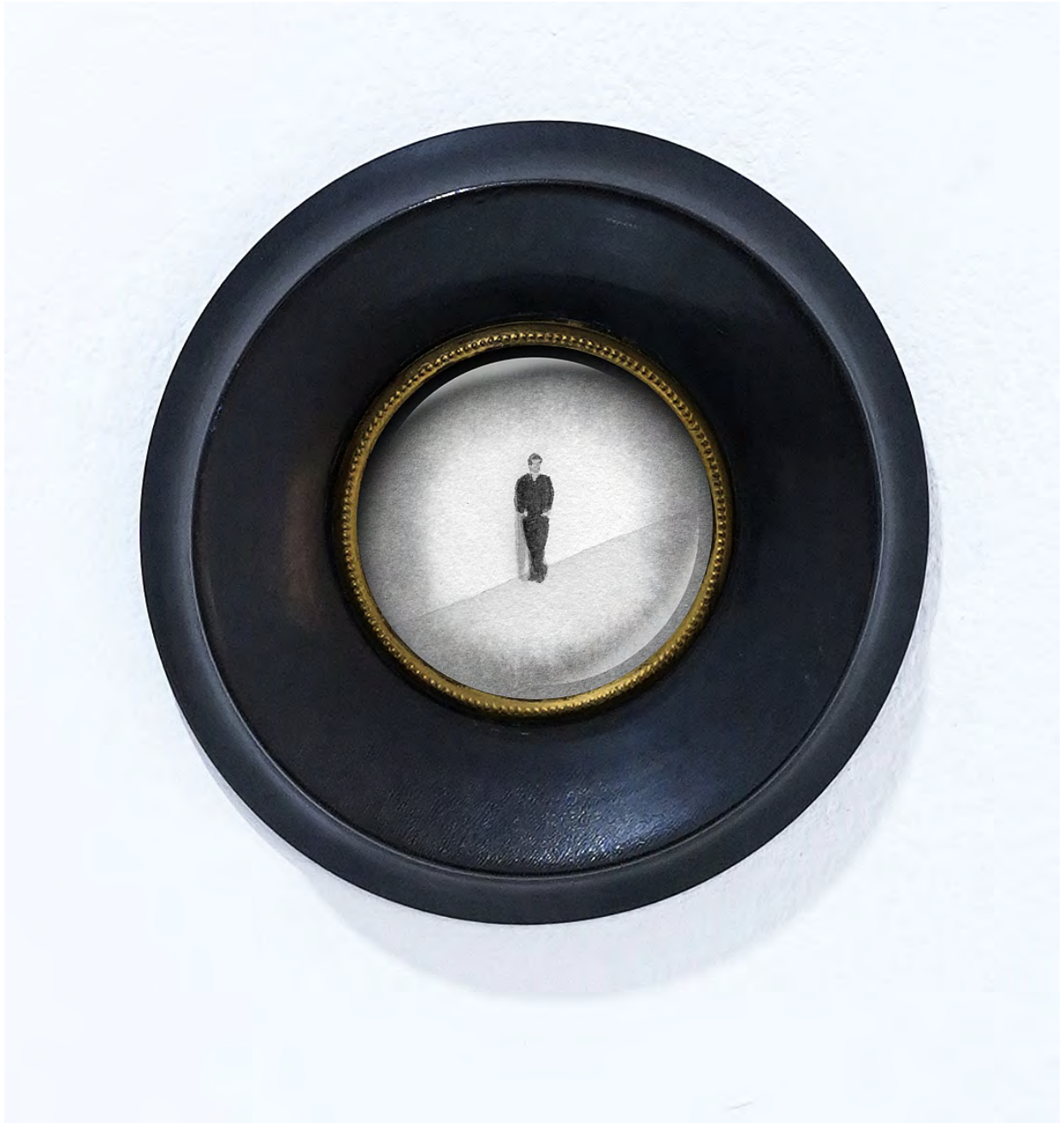
Fernando Martín Godoy Guardian VII , 2024 Ink on Paper and Antique Frame Framed Dimensions: 5.51h x 5.51w in PKR: 292,728.25