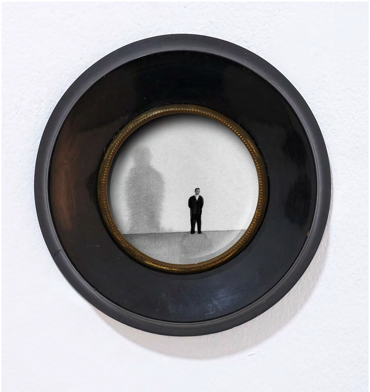
Fernando Martín Godoy Guardian III , 2024 Ink on Paper and Antique Frame Framed Dimensions: 6.30h x 6.30w in PKR: 310,797.89