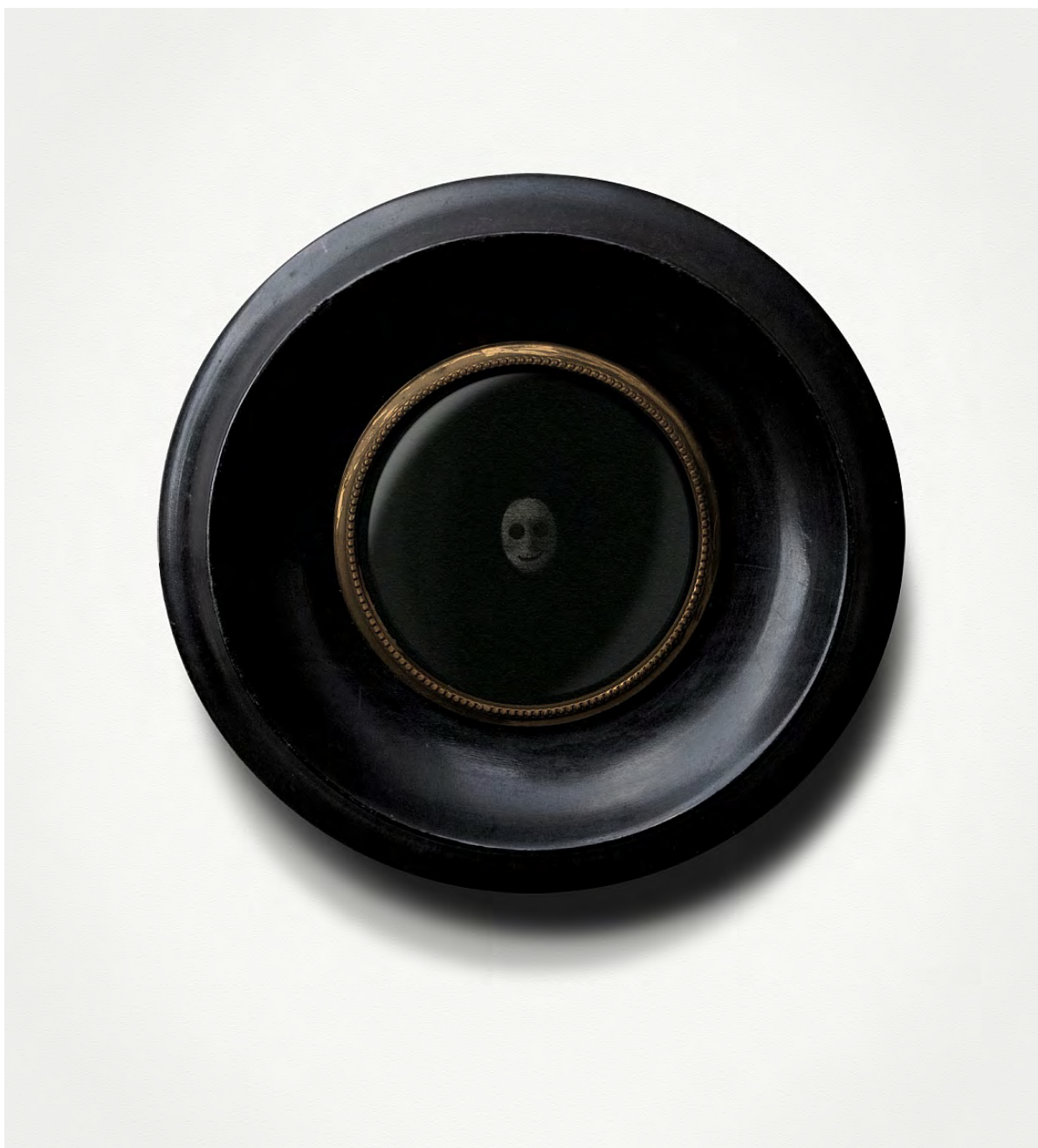
Fernando Martín Godoy Mask III , 2019 Ink on Paper and Antique Frame Framed Dimensions: 5.20h x 5.43w in PKR: 292,728.25