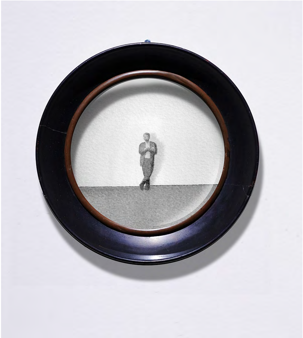
Fernando Martín Godoy Guardian IV , 2024 Ink on Paper and Antique Frame Framed Dimensions: 5.12h x 5.12w in PKR: 310,797.89