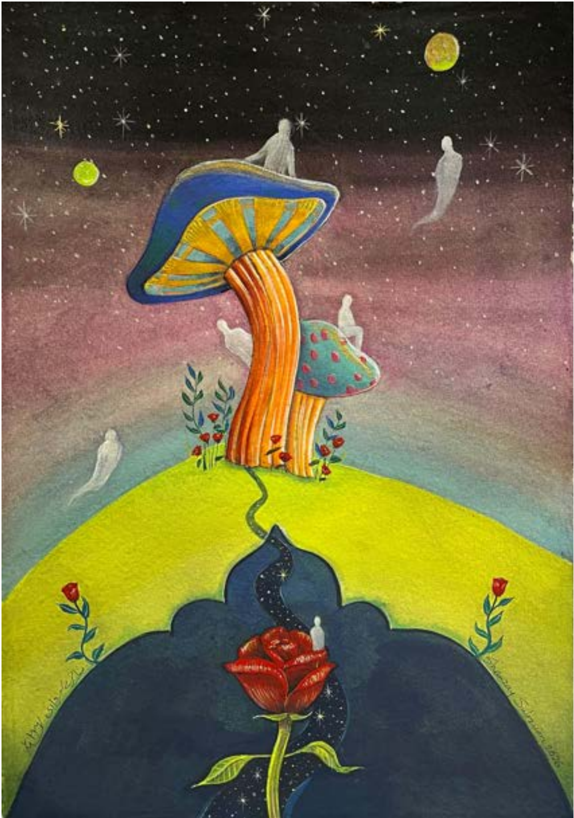
Shanzay Subzwari Whimsy , 2026 Gouache on Handmade Paper 11.50h x 8w in PKR 95,000