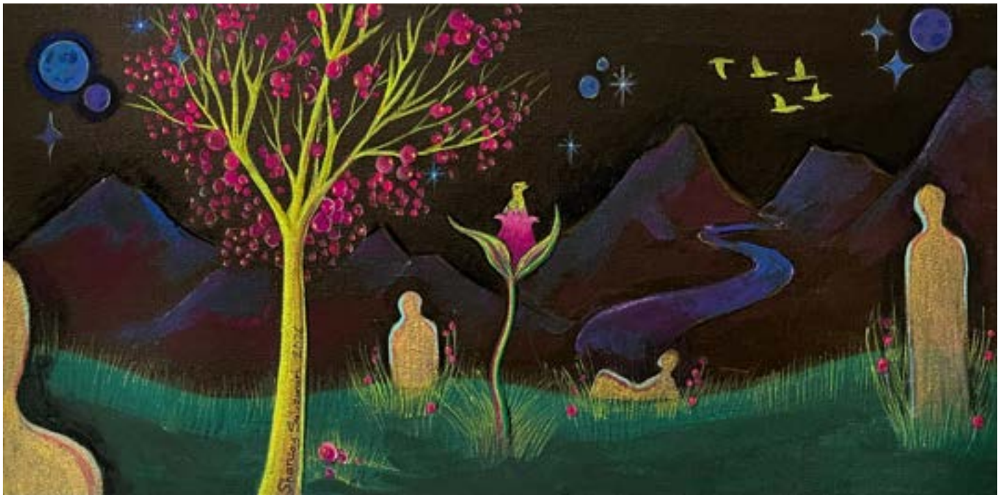
Shanzay Subzwari We Are All Here , 2026 Acrylic on Canvas 5h x 10w in PKR 38,000