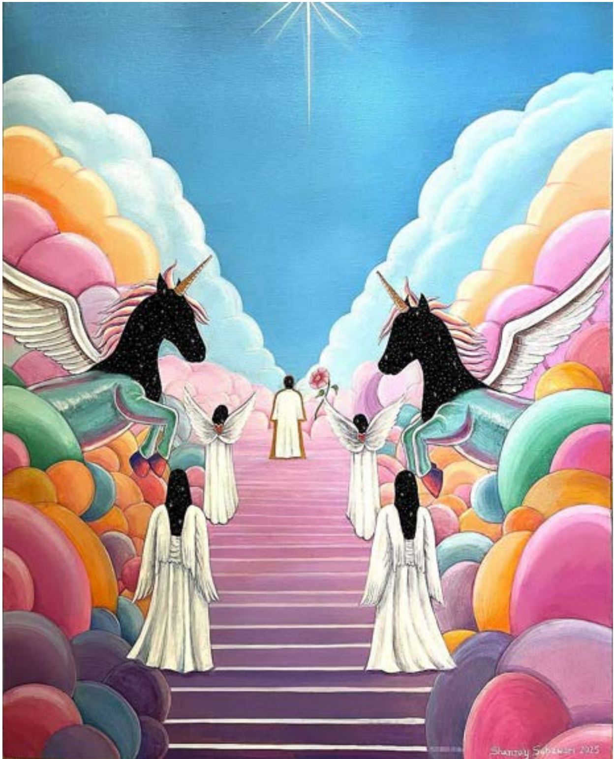
Shanzay Subzwari A Joyous Ascent , 2025 Acrylic on Canvas 30.50h x 24w in PKR 250,000