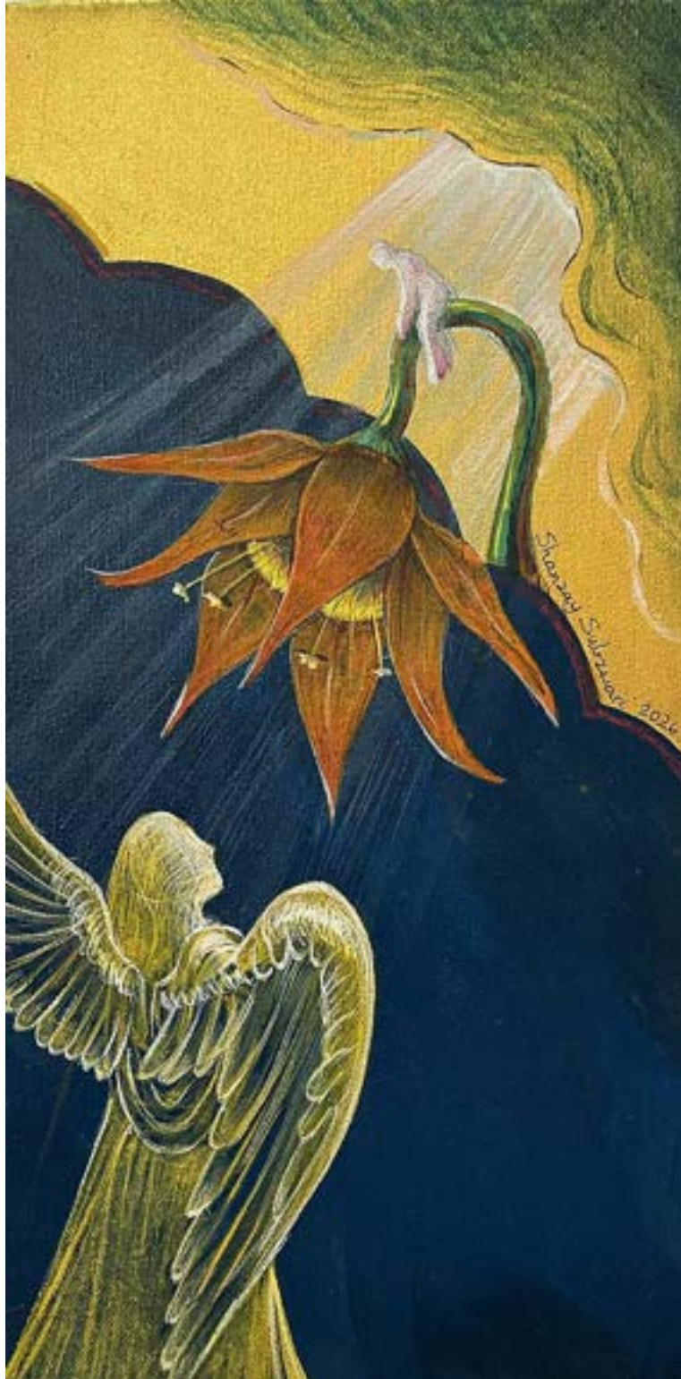
Shanzay Subzwari Touched By Gold , 2026 Acrylic on Canvas 10h x 5w in PKR 38,000