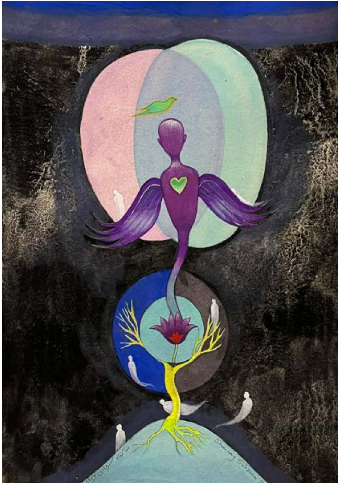
Shanzay Subzwari I'm Always Here , 2026 Gouache on Handmade Paper 11.50h x 8w in PKR 95,000