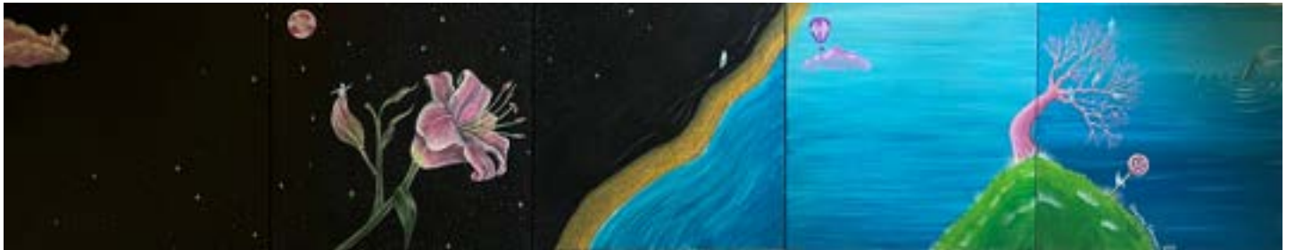
Shanzay Subzwari I Can Show You The World , 2025 Acrylic on Canvas 10h x 50w in PKR 170,000