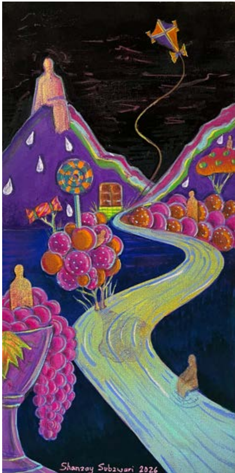
Shanzay Subzwari Candyland In The Skies , 2026 Acrylic on Canvas 10h x 5w in PKR 38,000