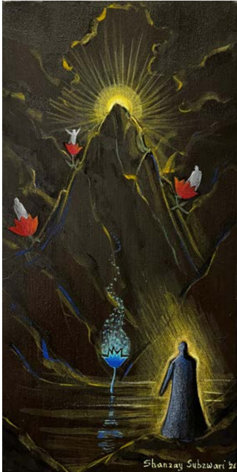
Shanzay Subzwari I Bloom Where I'm Planted, 2026 Acrylic on Canvas 10h x 5w in PKR 38,000