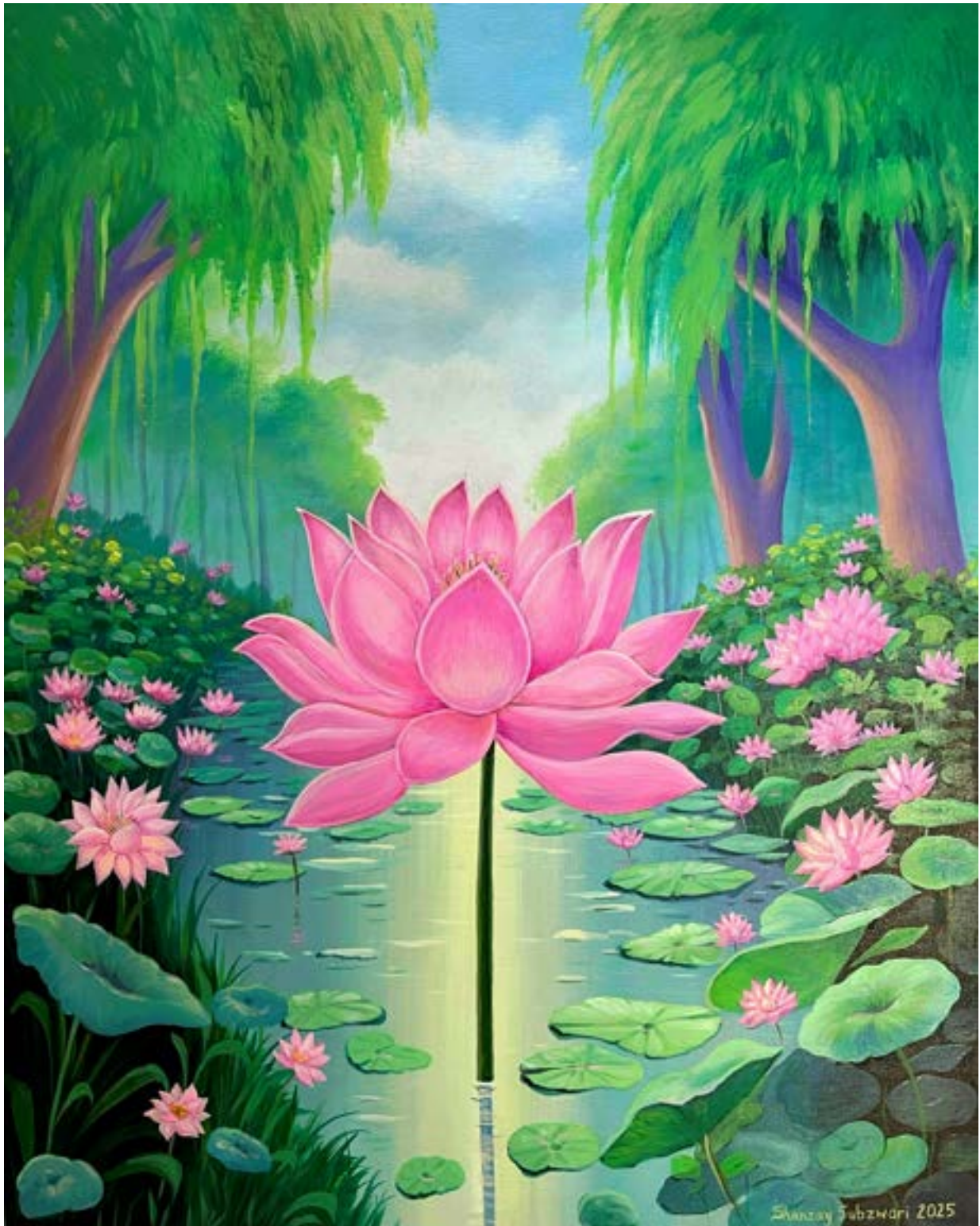
Shanzay Subzwari Tranquil Waters , 2025 Acrylic on Canvas 30.50h x 24w in PKR 250,000