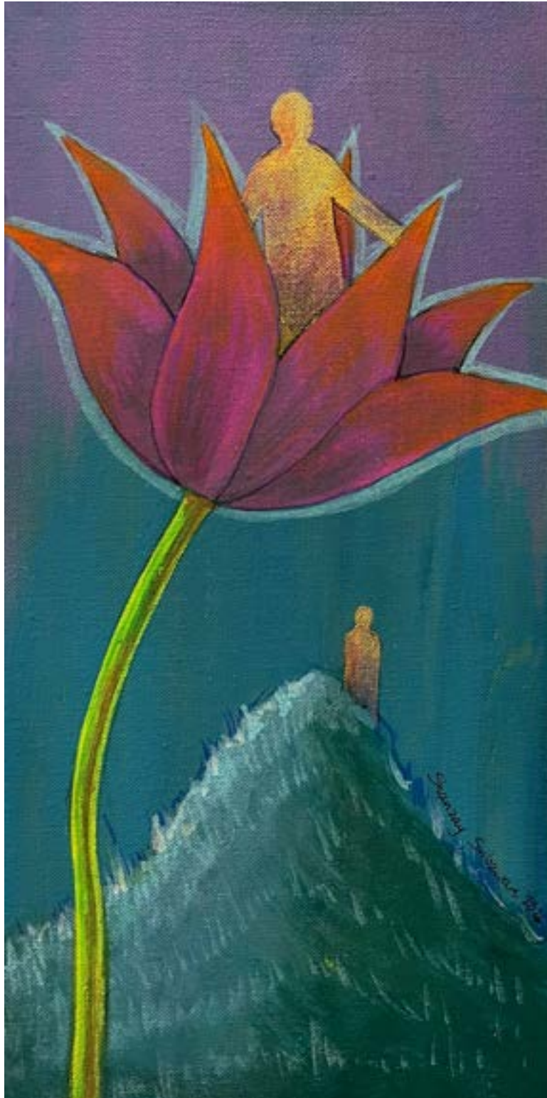
Shanzay Subzwari Happy Days, 2026 Acrylic on Canvas 10h x 5w in PKR 38,000