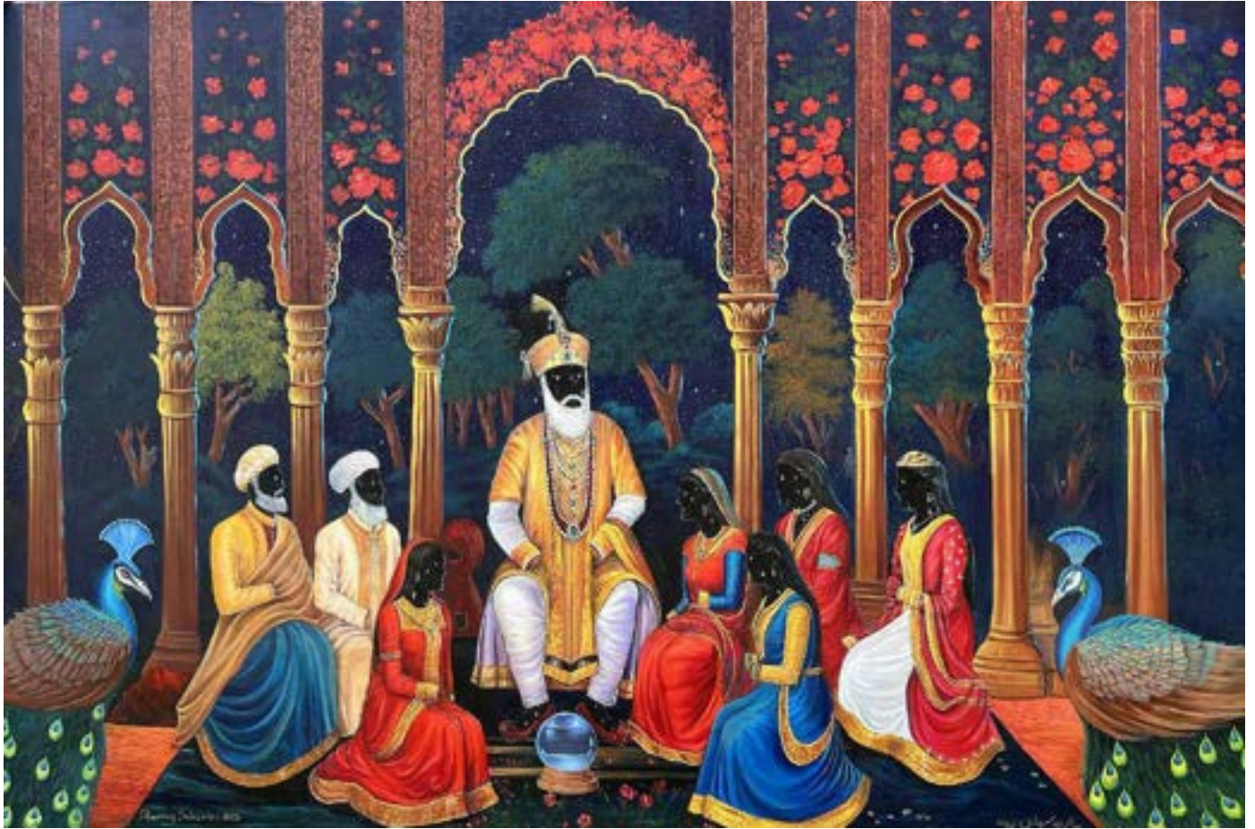
Shanzay Subzwari Darbar In The Skies , 2025 Acrylic on Canvas 48h x 72w in PKR 1,050,000