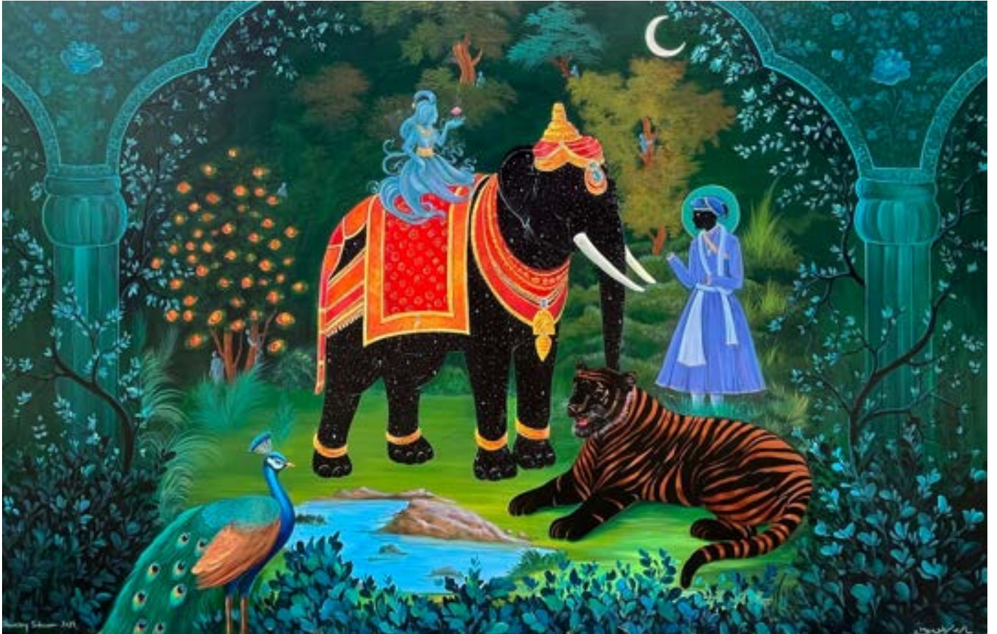
Shanzay Subzwari Jungle In The Clouds , 2025 Acrylic on Canvas 54h x 84w in PKR 950,000