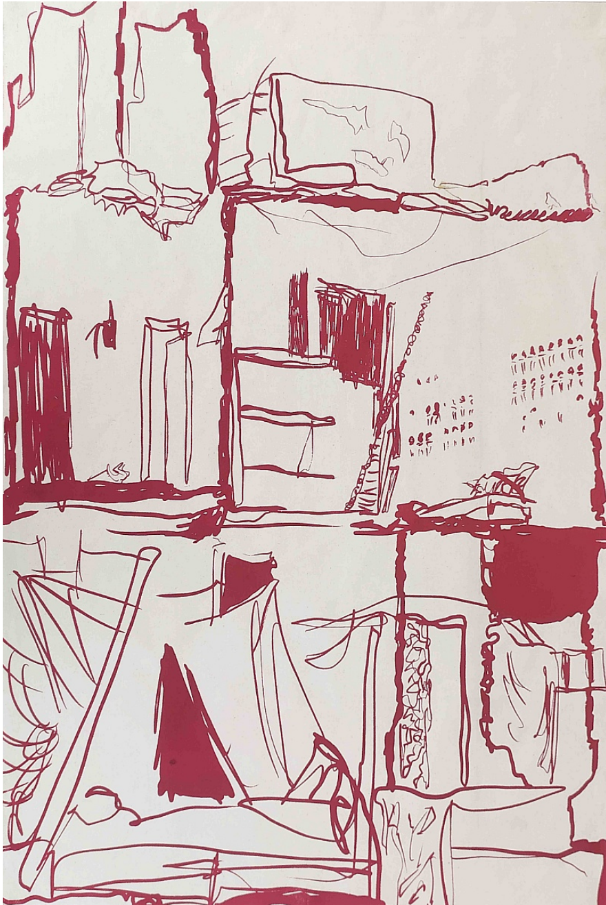
Zahabia Khozema What Remains 3 , 2023 Screen Print on Canvas 41h x 29.75w in 1/2 + AP Rs. 60,000