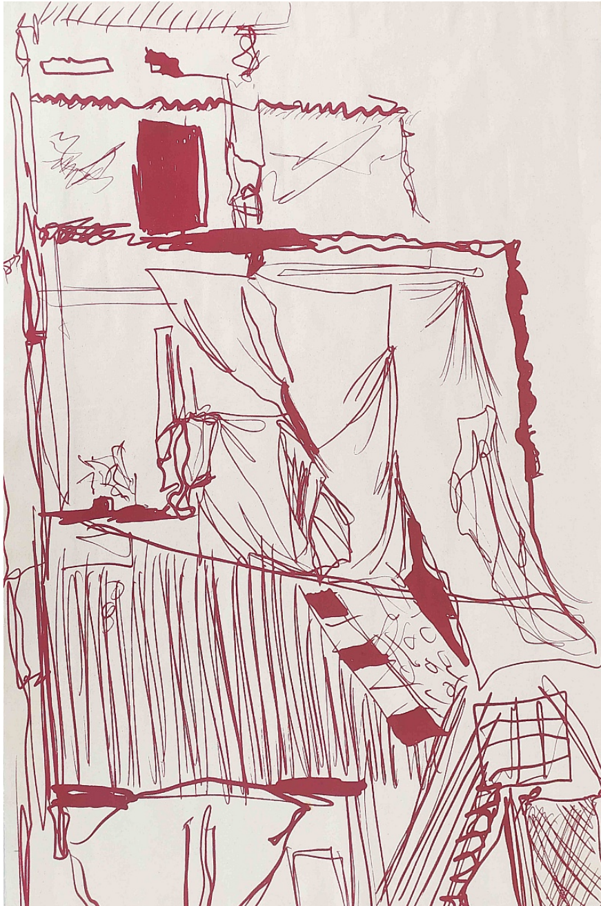
Zahabia Khozema What Remains 1, 2023 Screen Print on Canvas 41h x 29.75w in 1/2 + AP Rs. 60,000