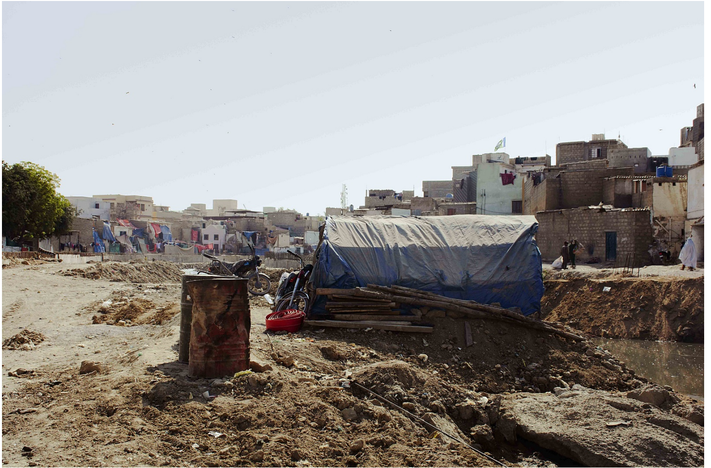
Zahabia Khozema Optics of the Nullah 3 , 2023 Digital Print on Paper 48h x 72w in 1/3 + AP Rs. 25,000