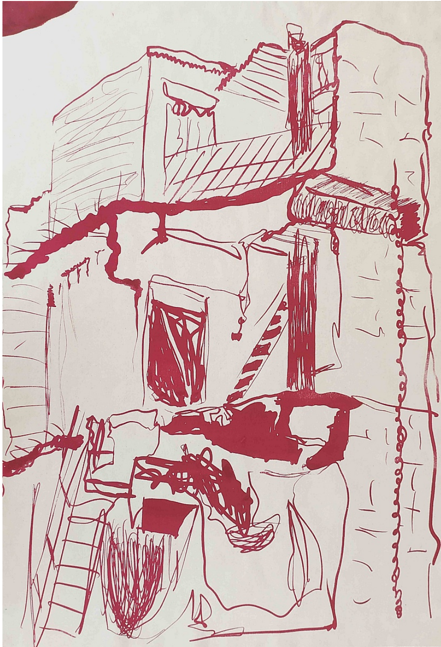
Zahabia Khozema What Remains 4 , 2023 Screen Print on Canvas 41h x 29.75w in 1/2 + AP Rs. 60,000