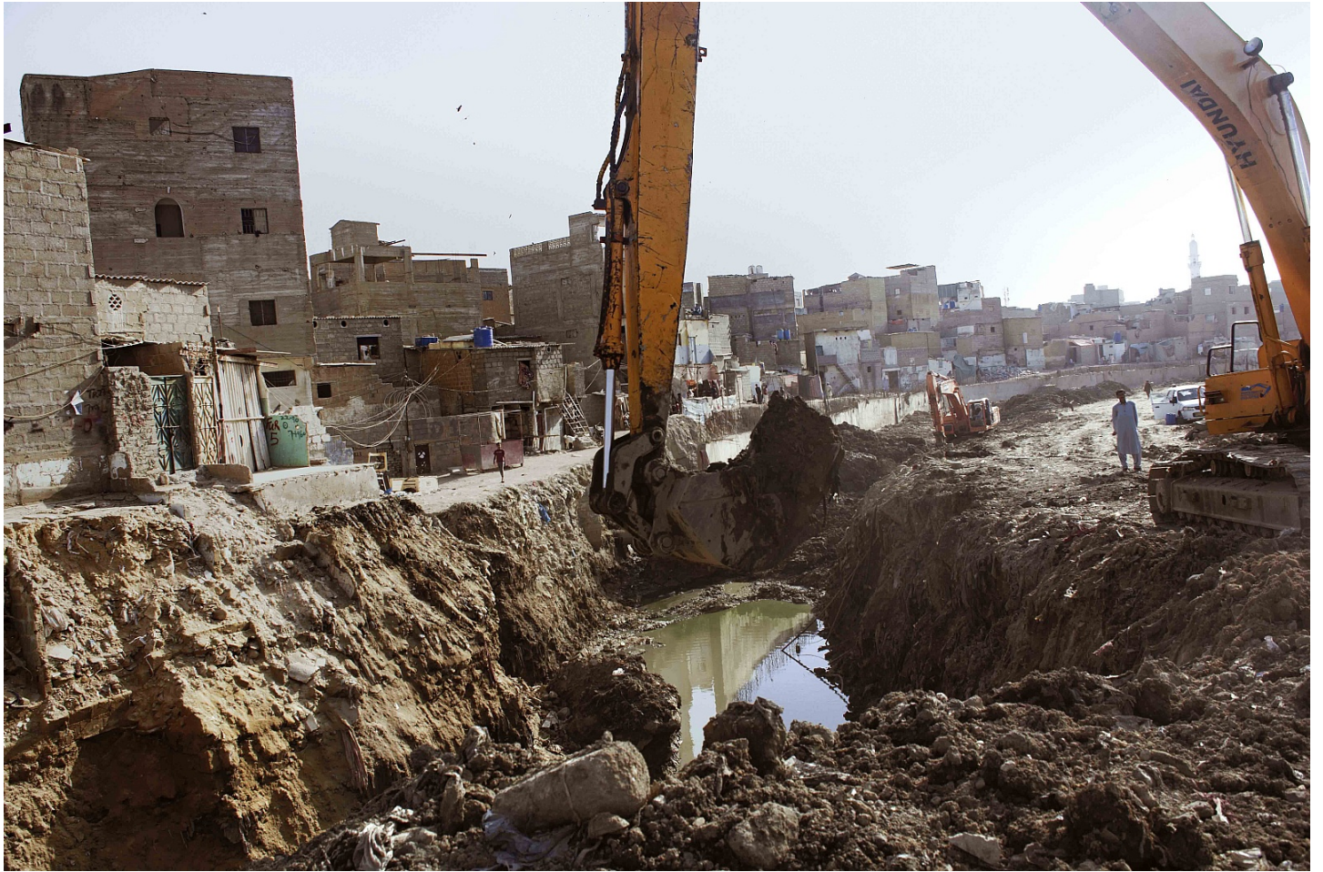
Zahabia Khozema Optics of the Nullah 1 , 2023 Digital Print on Paper 48h x 72w in 1/3 + AP Rs. 25,000