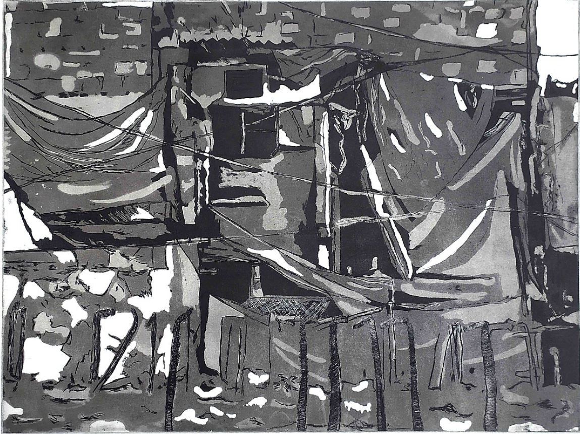
Zahabia Khozema Untitled 1, 2023 Etching and Aquatint 20.75h x 24.75w in 1/2 + AP Rs. 45,000