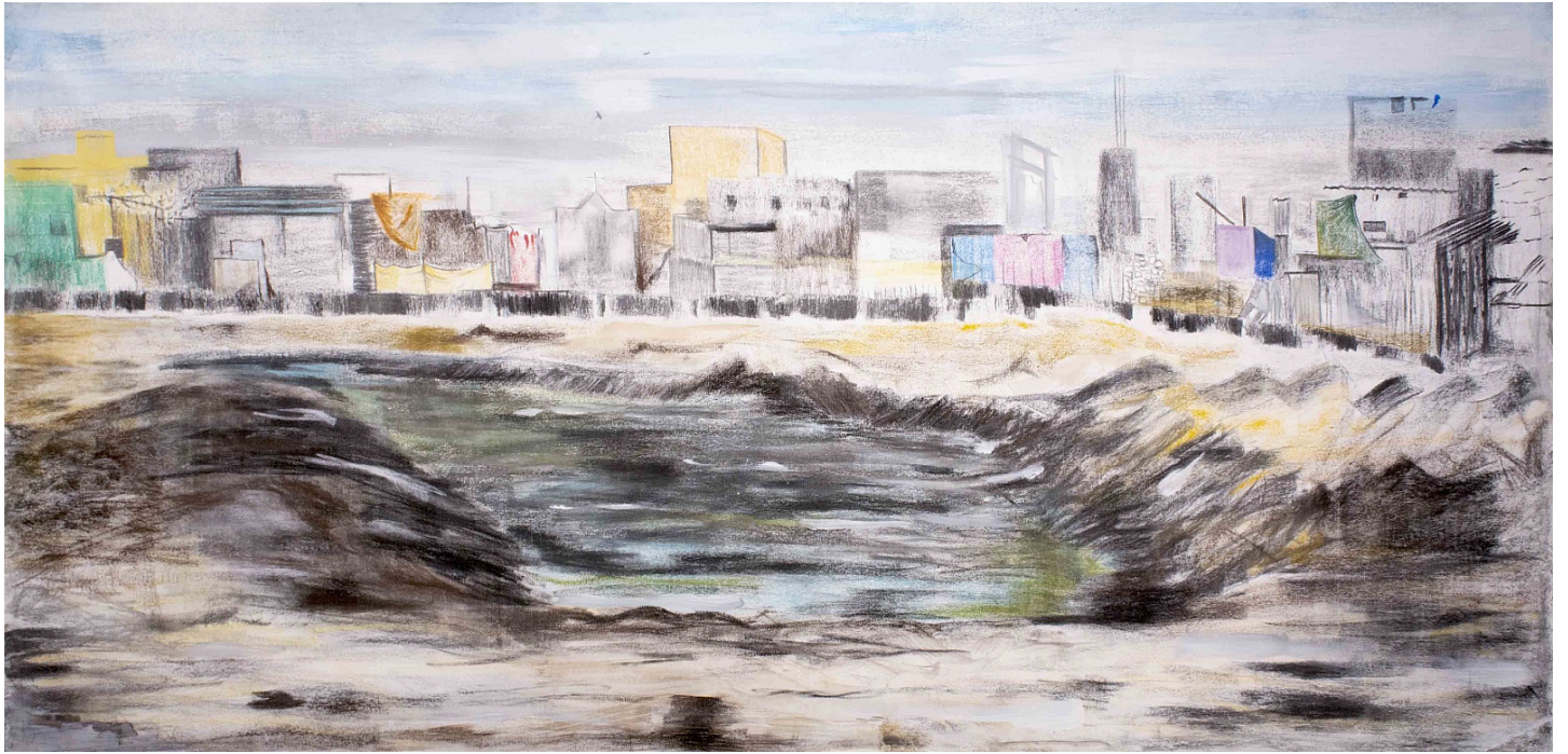
Zahabia Khozema At the Nullah 2 , 2023 Mixed Media on Canvas 50h x 95w in Rs. 100,000