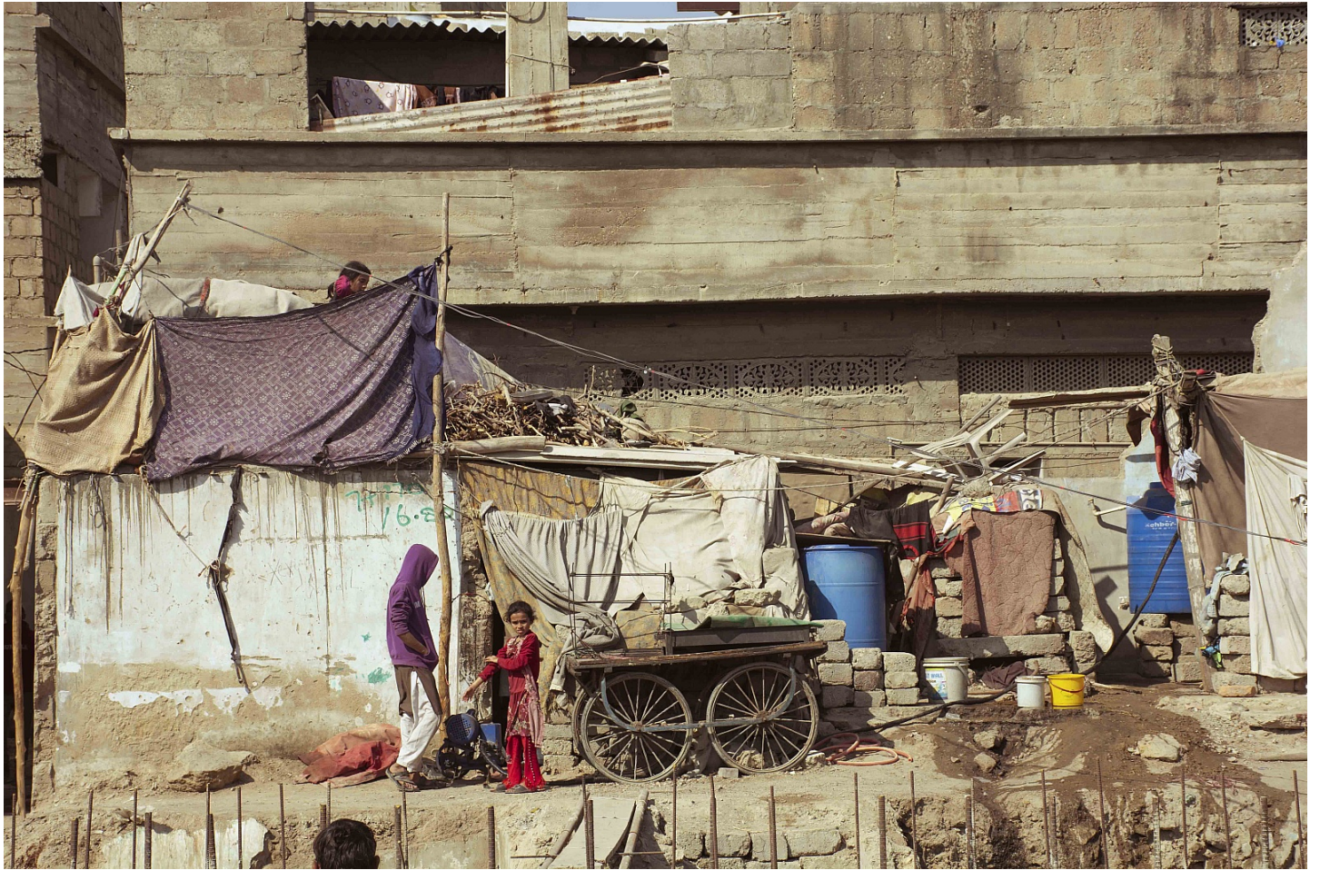
Zahabia Khozema Optics of the Nullah 2 , 2023 Digital Print on Paper 48h x 72w in 1/3 + AP Rs. 25,000