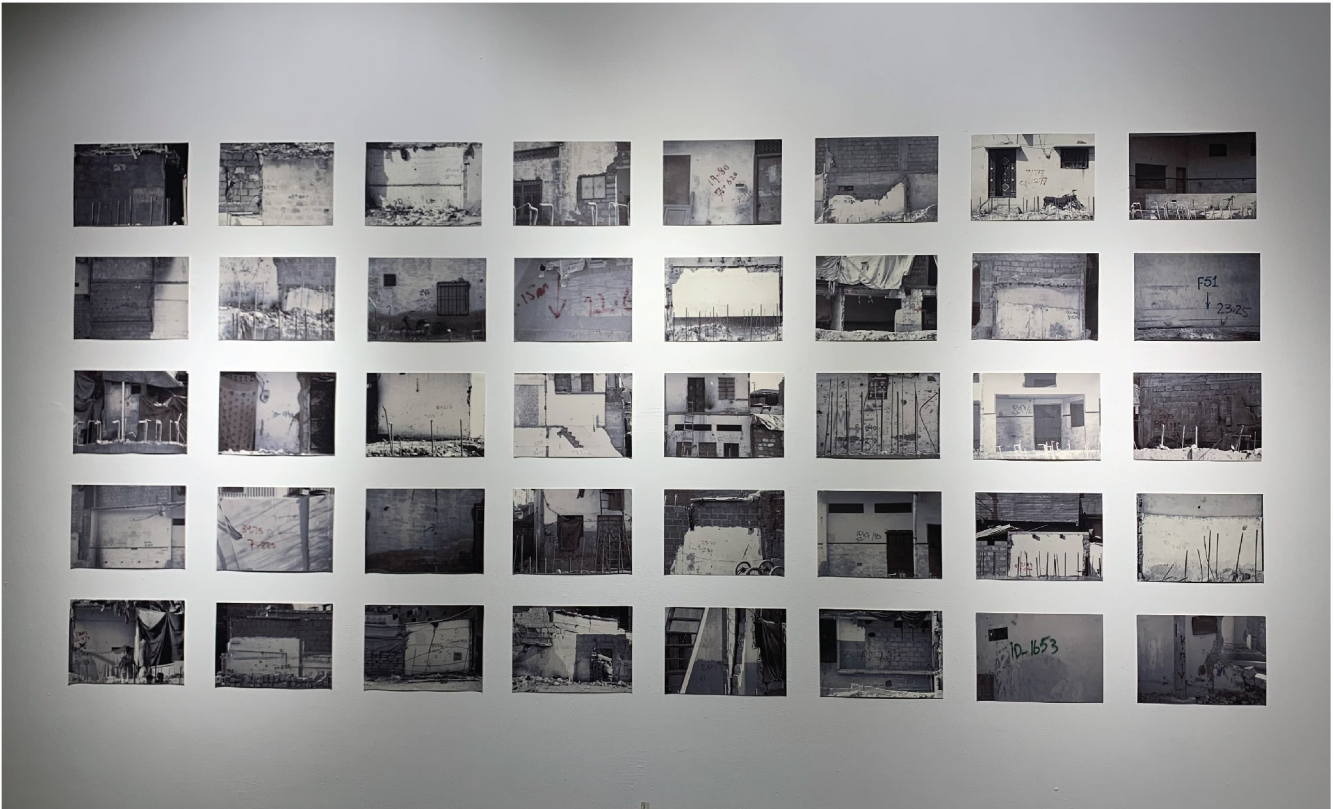
Zahabia Khozema Marked (set of 40 pictures), 2023 Digital Print on Cartridge Paper 8h x 11.40w in 1/2 + AP Rs. 5,000 each