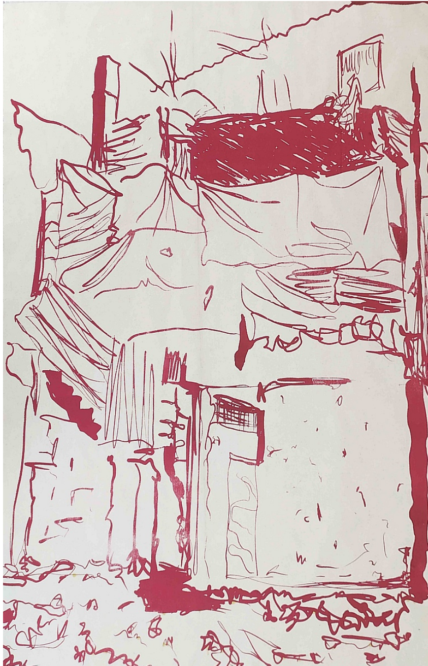
Zahabia Khozema What Remains 2, 2023 Screen Print on Canvas 41h x 29.75w in 1/2 + AP Rs. 60,000