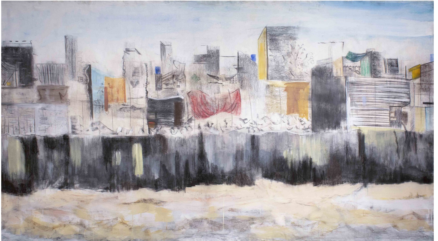
Zahabia Khozema At the Nullah 1, 2023 Mixed Media on Canvas 55h x 94w in Rs. 125,000